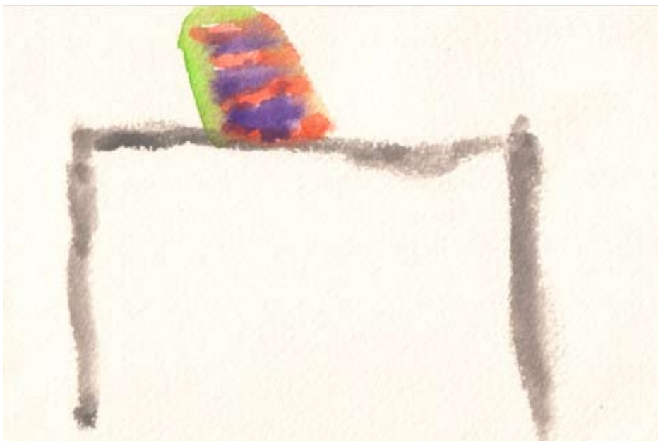
Honourable Mention – Jordan Lau - Toronto, ON Title: Snail's Desk Watercolour