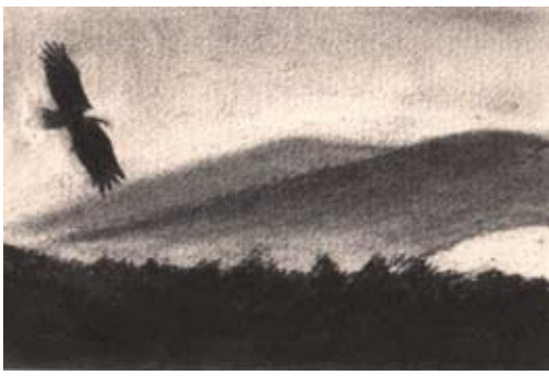
Aaron Combs – Slave Lake, AB Untitled – Charcoal