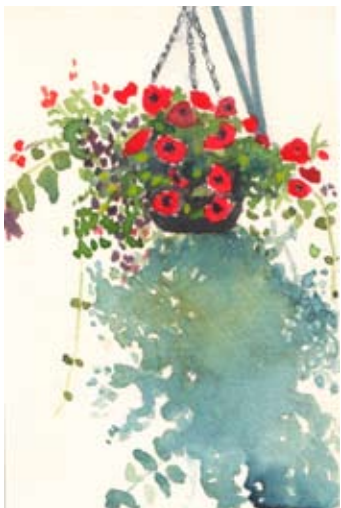
Teri Wing – Gananaoque, ON Untitled – Watercolour

Saunders Waterford Postcard Competition 2008