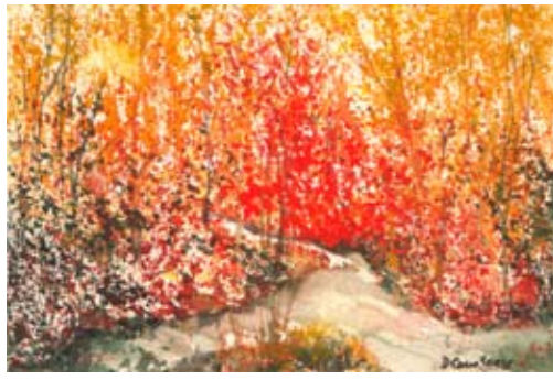
Dawna Courtney – Caledon, ON Untitled – Watercolour