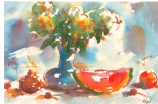
M Delija – North York, ON Untitled – Watercolour