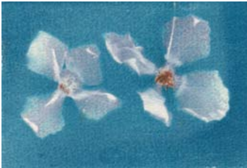
Cameron Yong – Calgary, AB Untitled – Watercolour