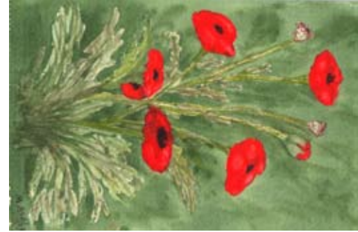
Marlene Ash – Aurora, ON Untitled – Watercolour